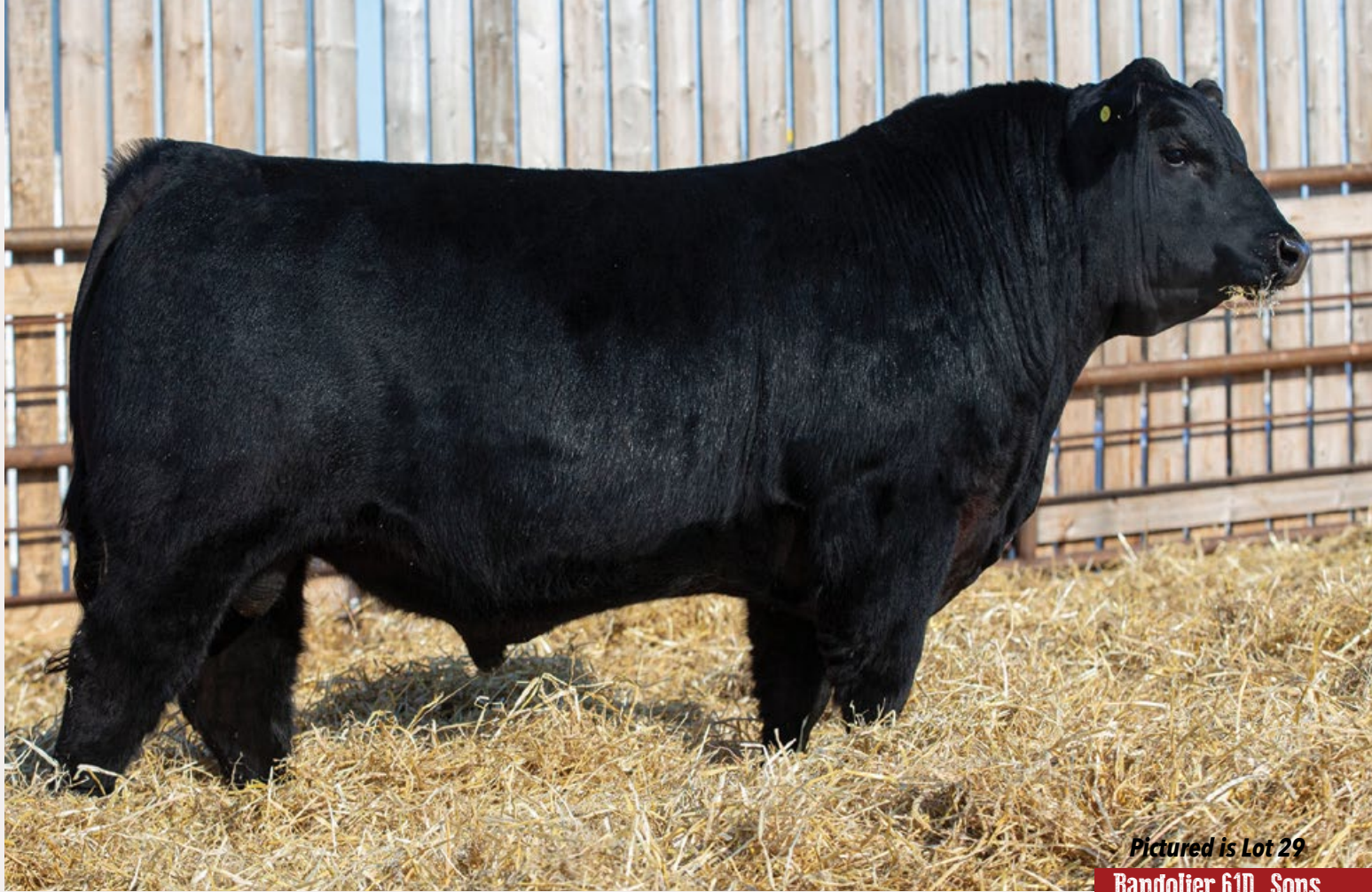
Pictured is Lot 29 Bandolier 61D Sons