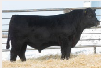
Blackman 11G - Maternal brother to FAR 152J