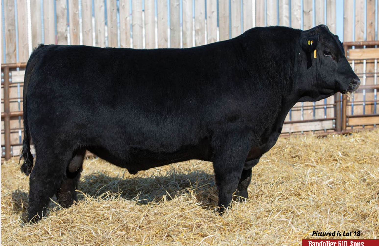
Pictured is Lot 18 Bandolier 61D Sons