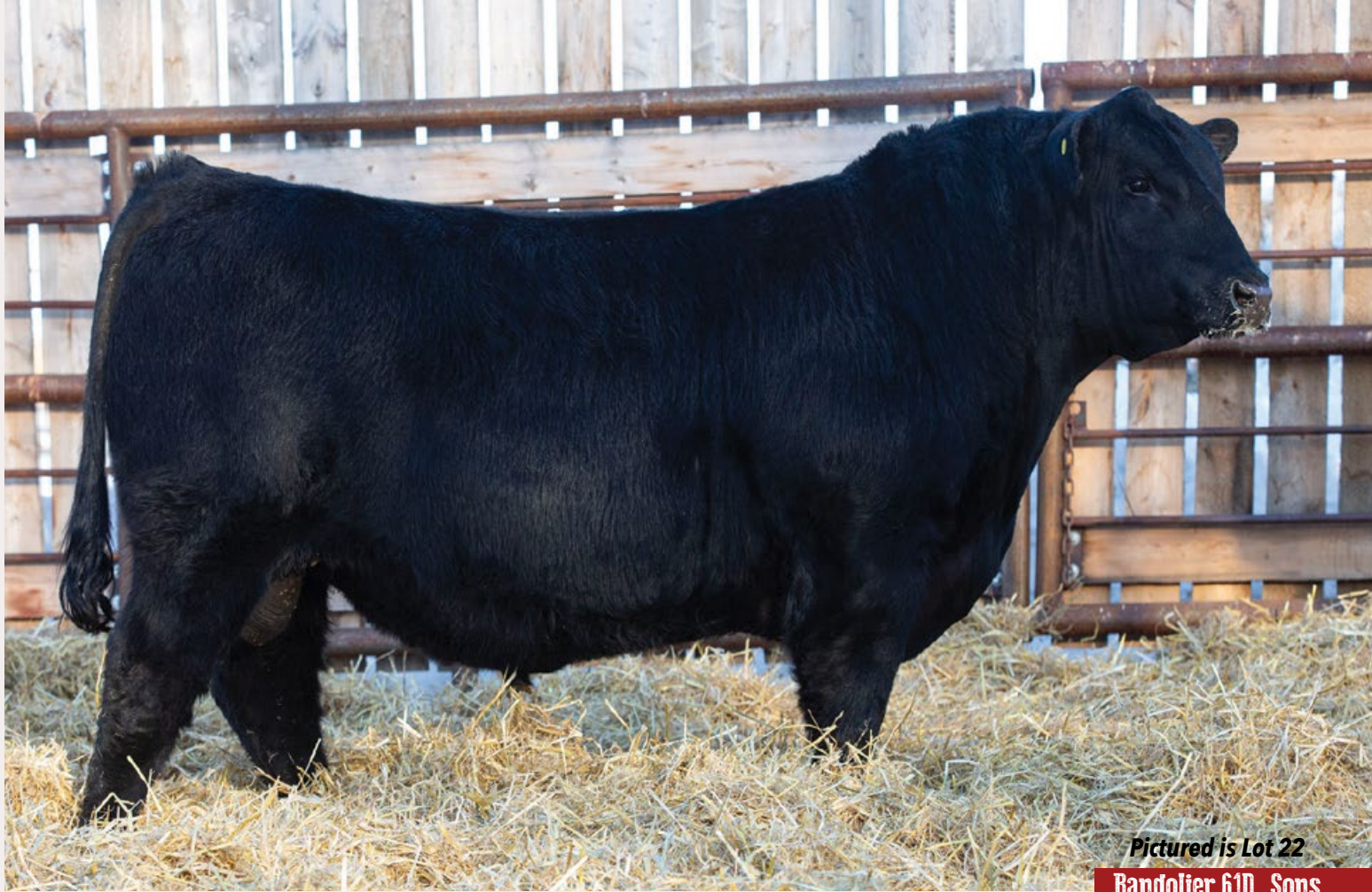
Pictured is Lot 22 Bandolier 61D Sons