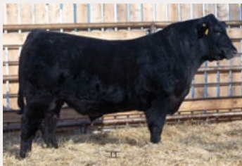
Tom Boy 31H - Maternal brother to FAR 56J