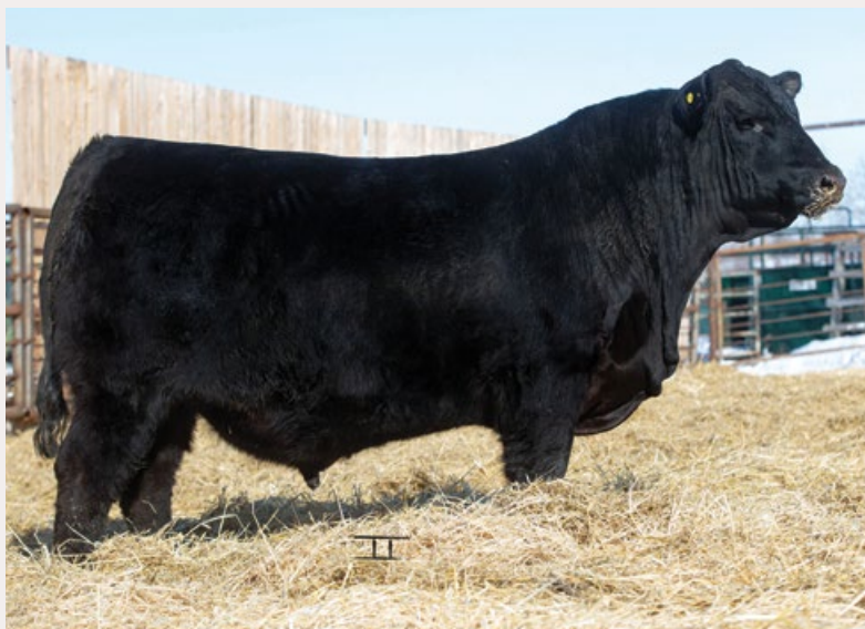
Winston 73H - Maternal brother to FAR 60J