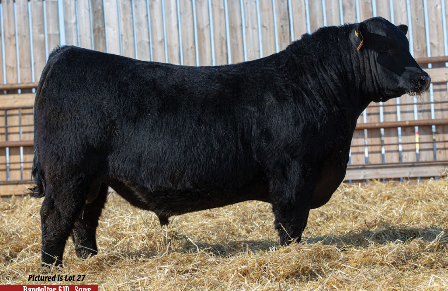
Pictured is Lot 27