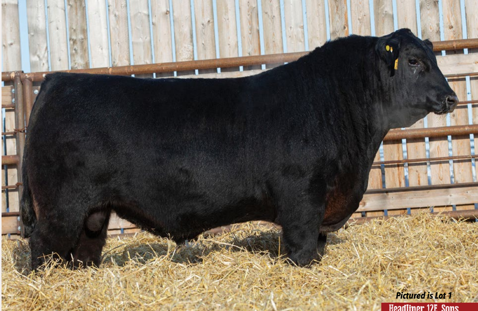
Pictured is Lot 1 Headliner 12E Sons