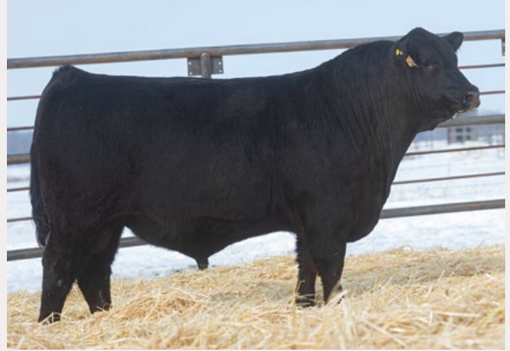
Bardolene 66G - Maternal brother to FAR 142J