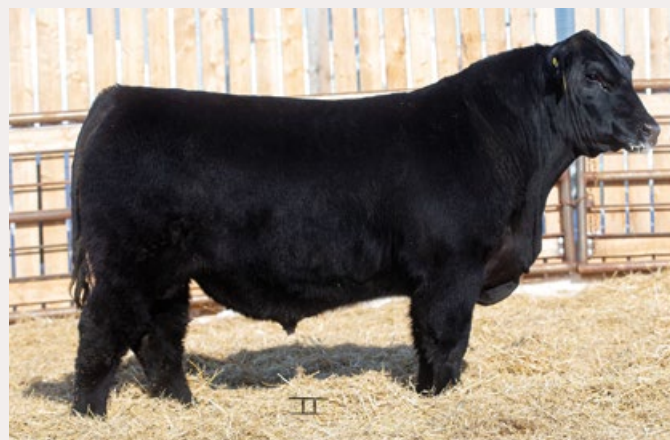
Bardolene 51H - Maternal brother to FAR 86J