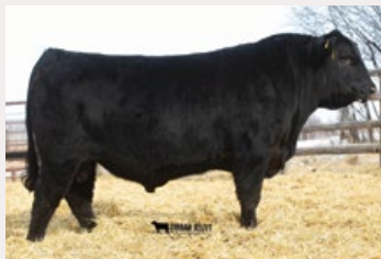
Winston 25F - \frac{3}{4} brother to FAR 56J