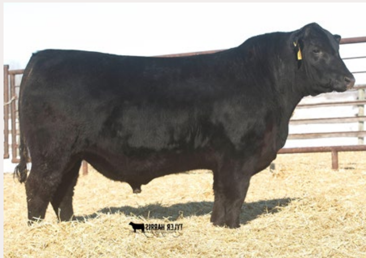
Northern 14E - Maternal brother to FAR 97J