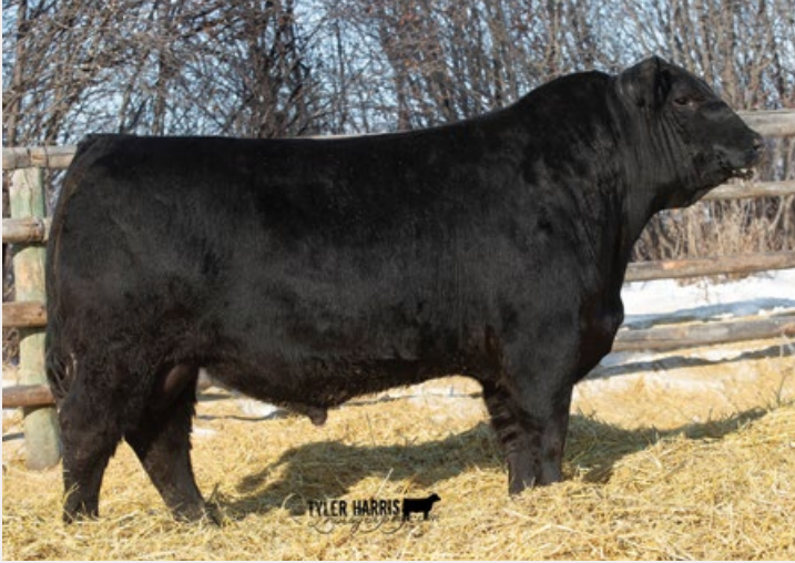
Knight 9F - Maternal brother to FAR 142J