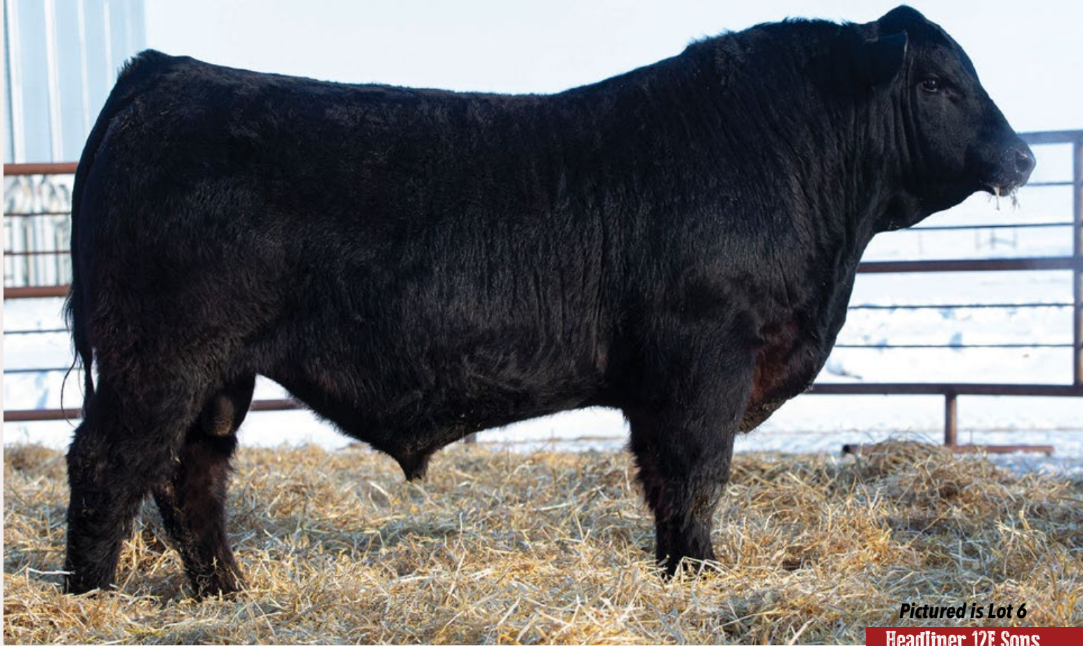
Pictured is Lot 6 Headliner 12E Sons