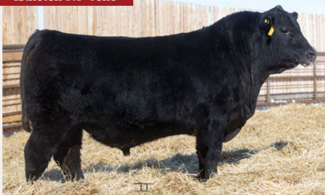
Eric 101H - Maternal brother to FAR 69J