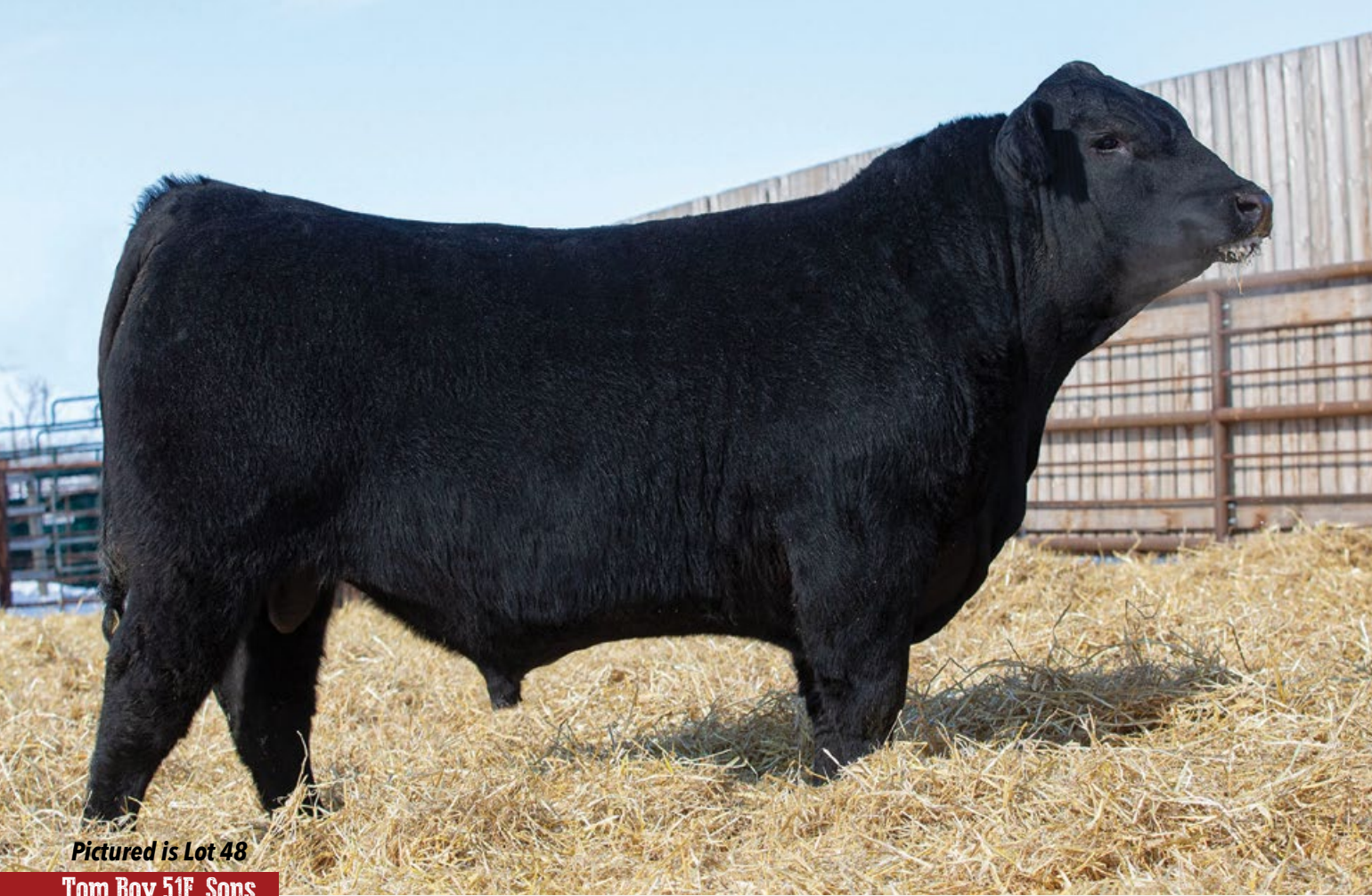
Pictured is Lot 48