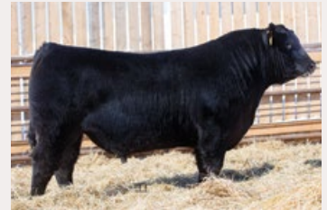
Tom Boy 18H - Maternal brother to FAR 152J