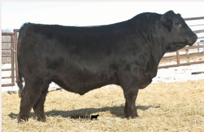
Bardolene 120E - Maternal brother to FAR 167J