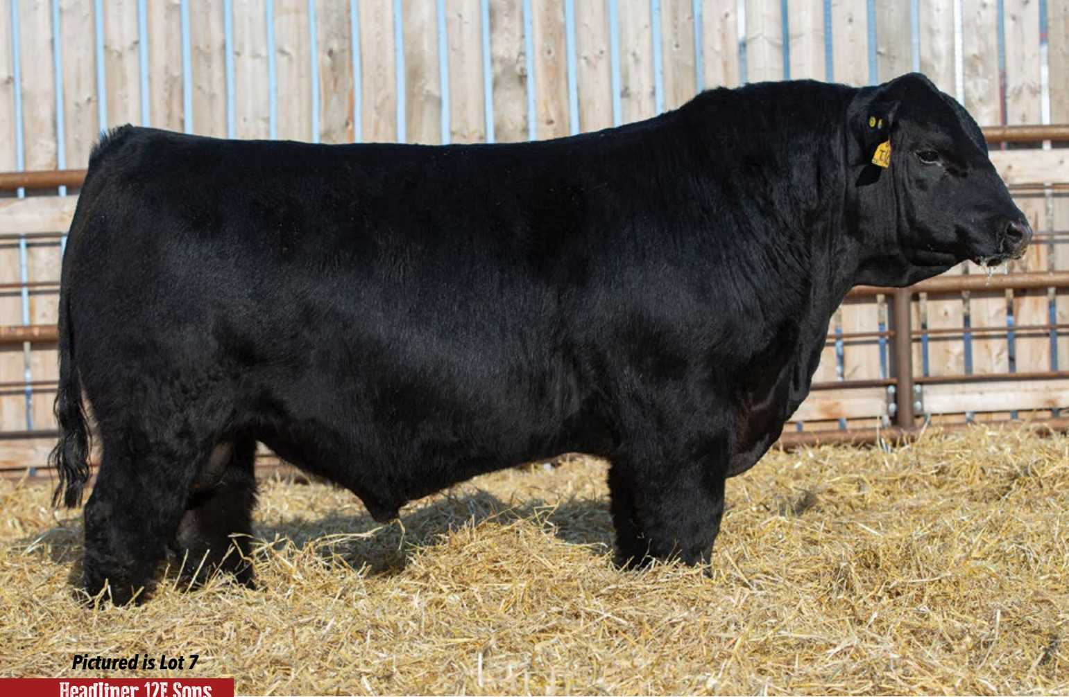
Pictured is Lot 7 Headliner 12E Sons