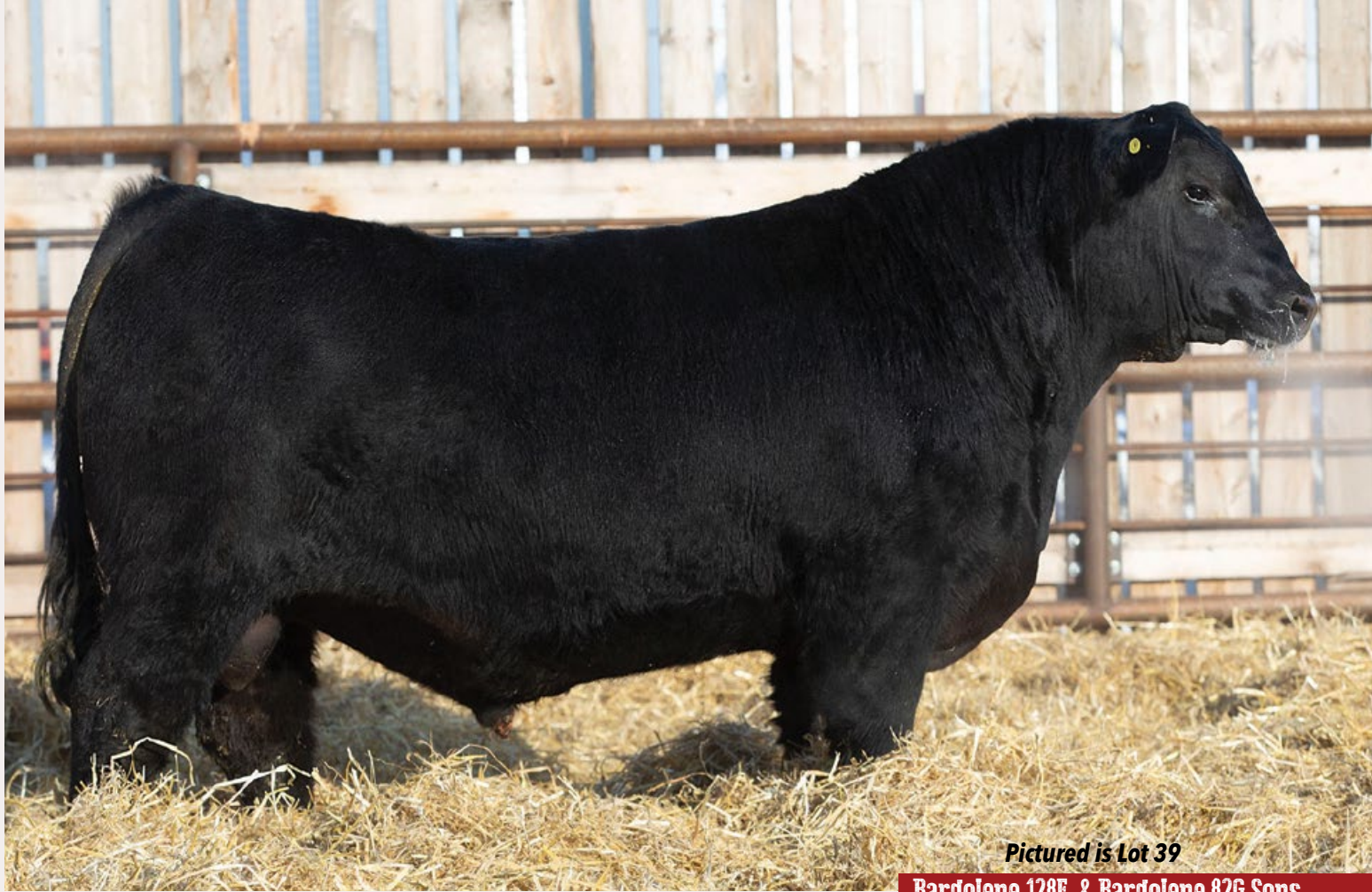
Pictured is Lot 39