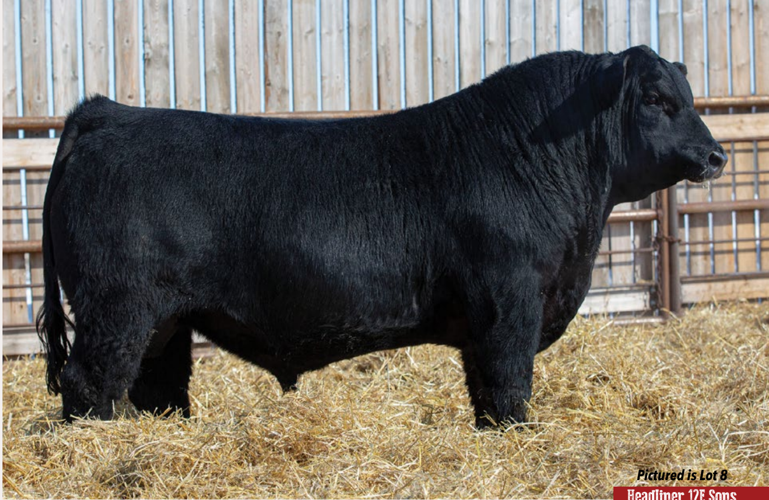
Pictured is Lot 8 Headliner 12E Sons

Tom Boy 73G - Maternal brother to FAR 83J