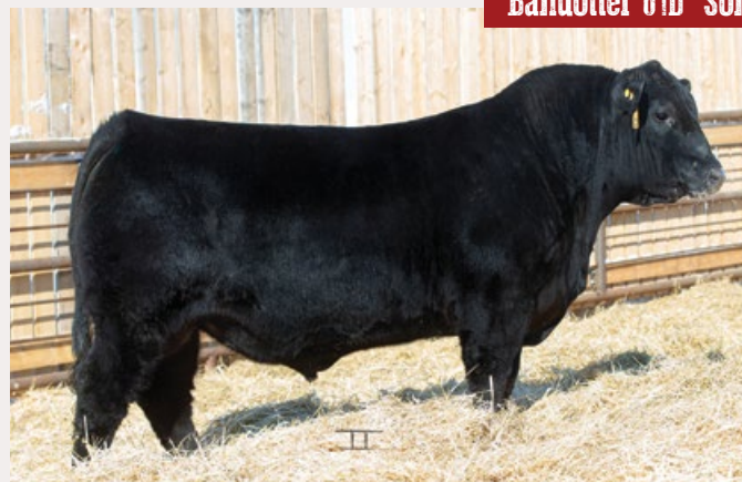
Bardolene 49H - Maternal brother to FAR 12J