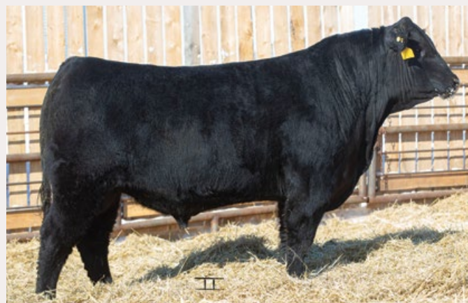
Eric 81H -- Maternal brother to FAR 77J