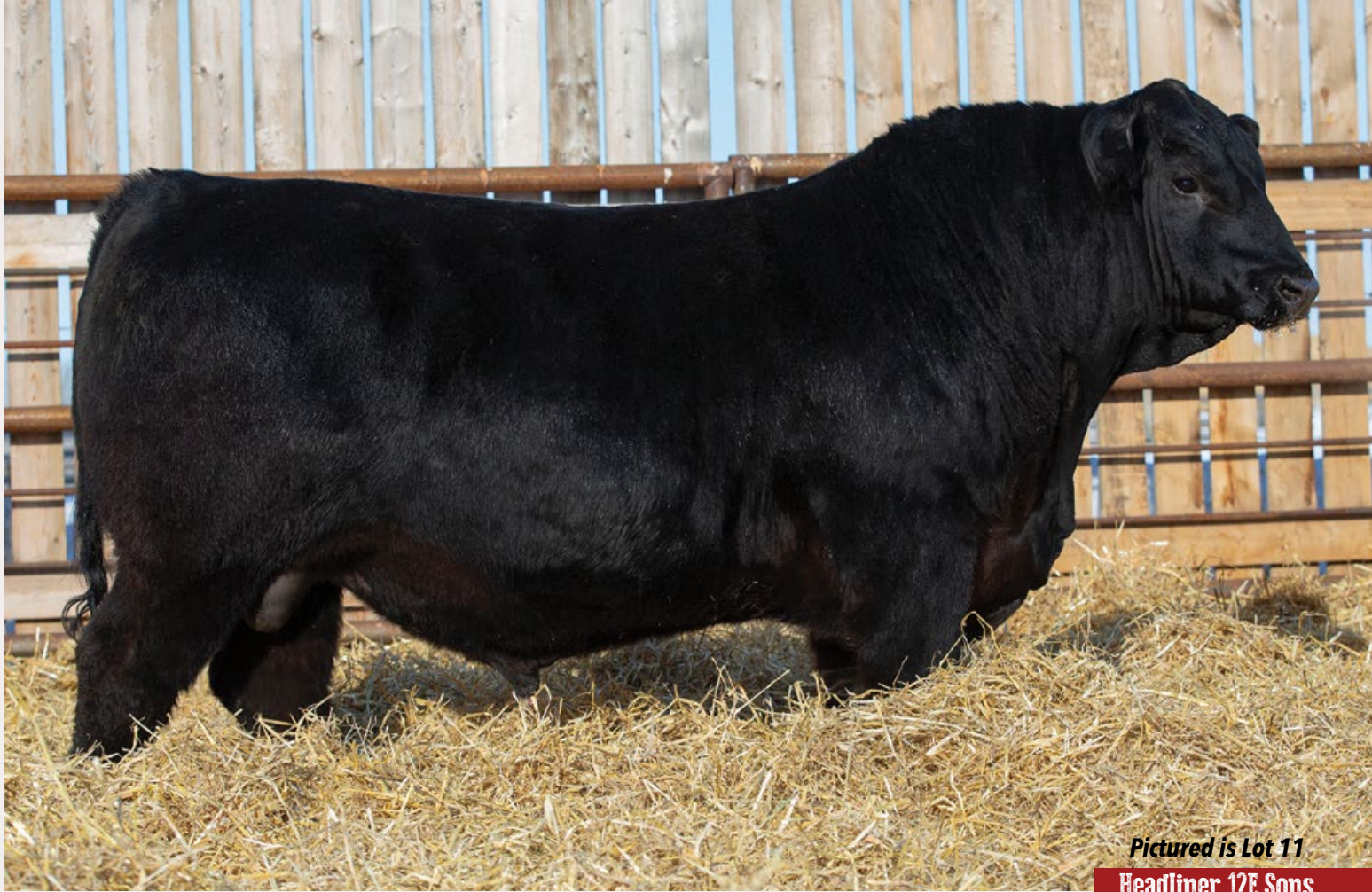
Pictured is Lot 11 Headliner 12E Sons

Winston 26F - Maternal brother to FAR 133J