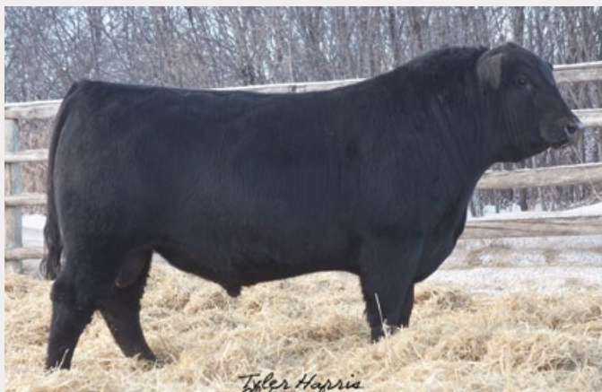
Bandolier 45B - Maternal brother to FAR 167J