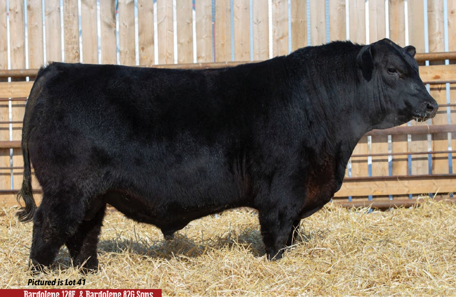
Pictured is Lot 41