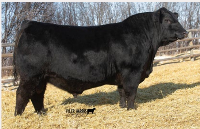
Tom Boy 78F -- Maternal brother to FAR 75J