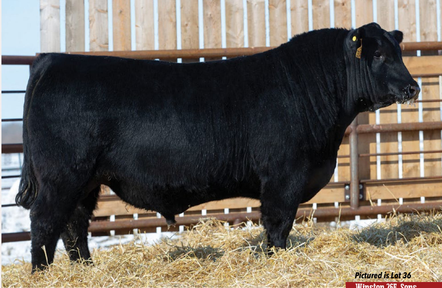
Pictured is Lot 36 Winston 26F Sons