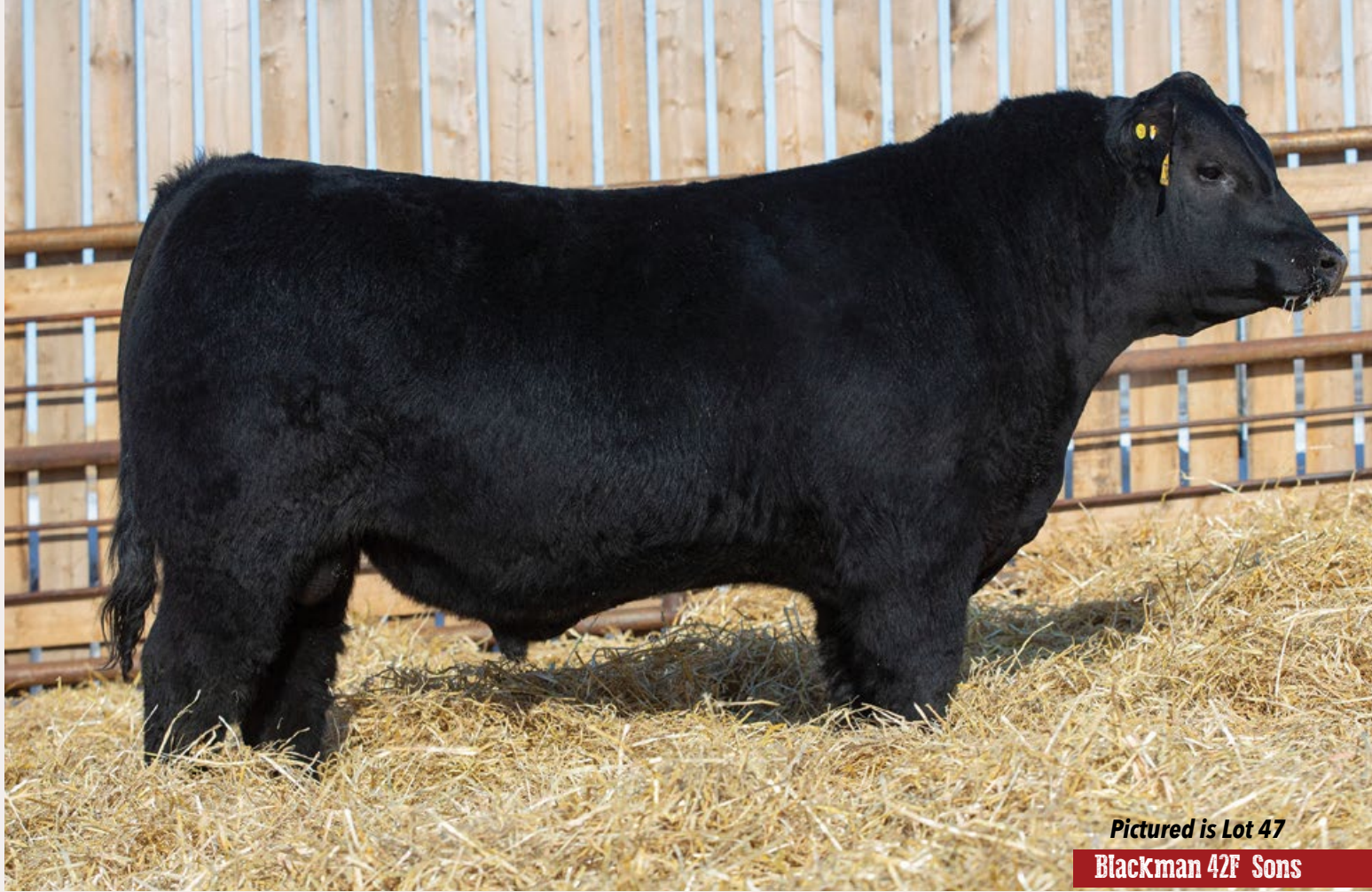
Pictured is Lot 47