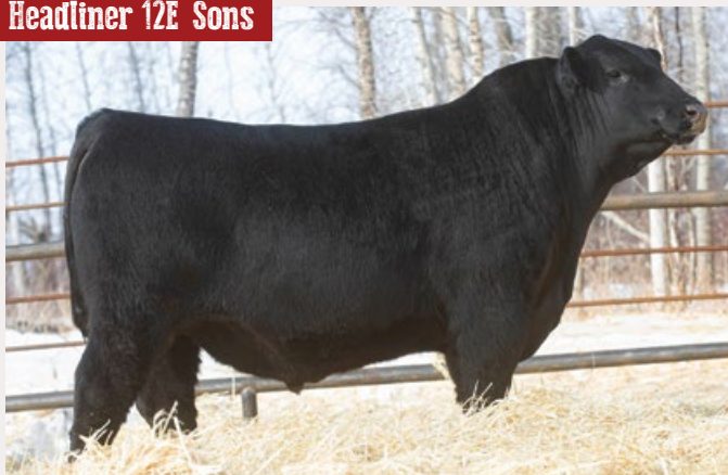
Bardolene 49G - Maternal brother to FAR 167J