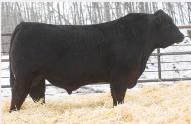
Tom Boy 58G - Maternal brother to FAR 203J