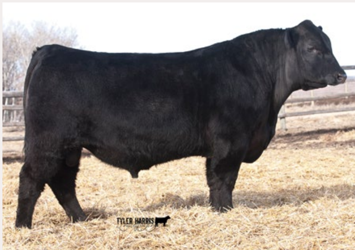
Northern 17C - Maternal brother to FAR 52J