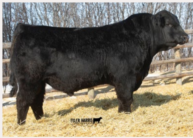
Winston 11F - Maternal brother to FAR 51J