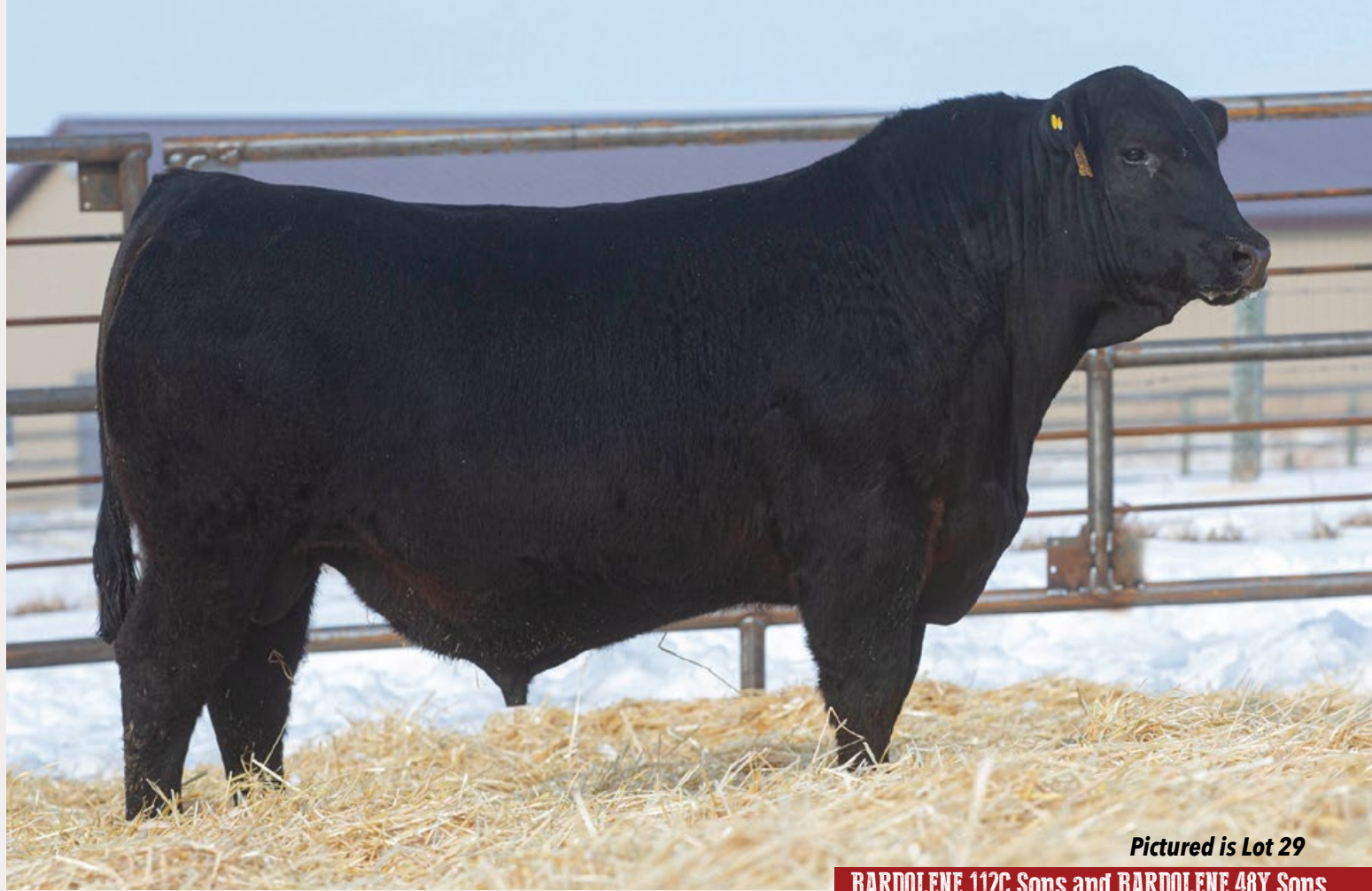
Pictured is Lot 29

BARDOLENE 112C Sons and BARDOLENE 48Y Sons