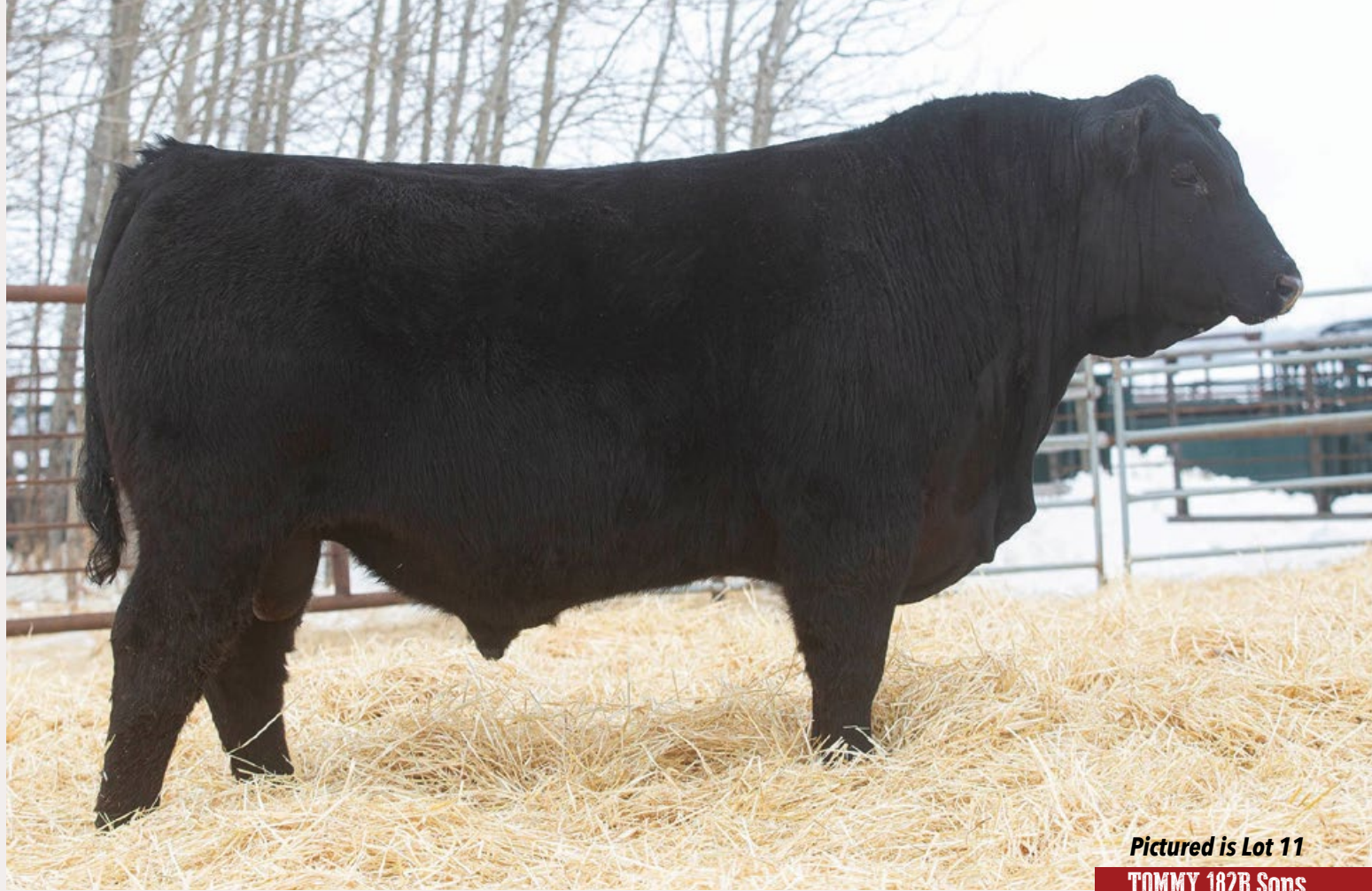
Pictured is Lot 11 TOMMY 182B Sons