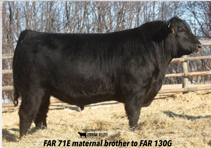
FAR 71E maternal brother to FAR 130G