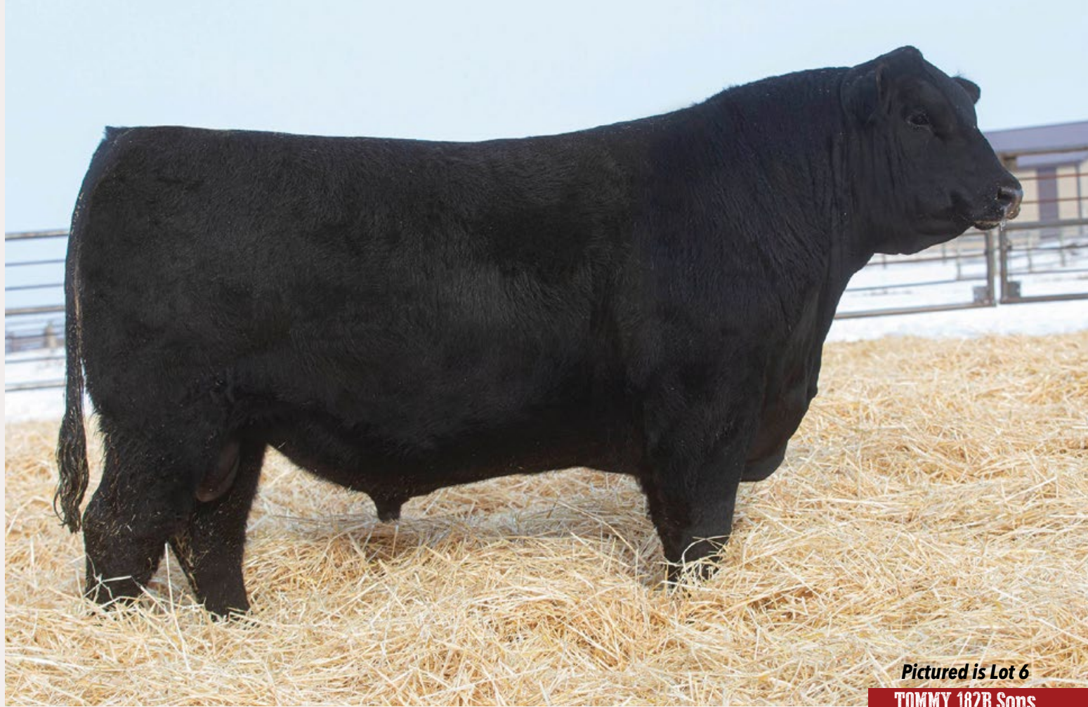
Pictured is Lot 6 TOMMY 182B Sons