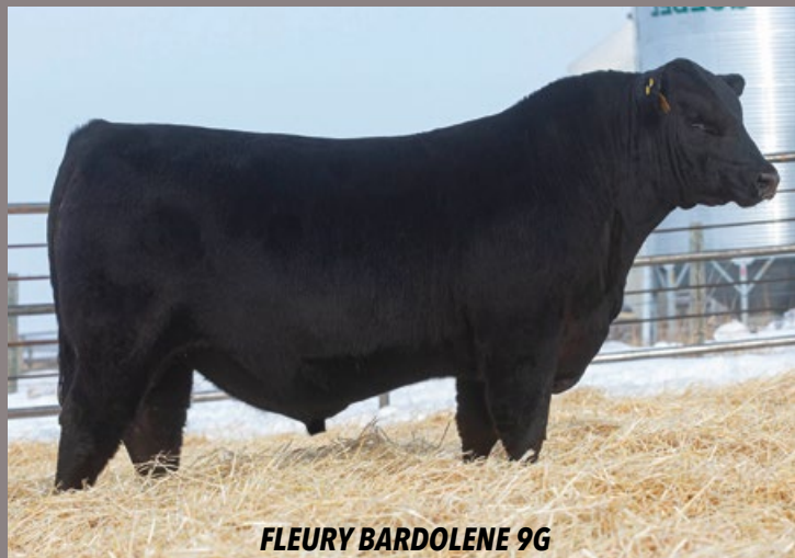
FLEURY BARDOLENE 9G