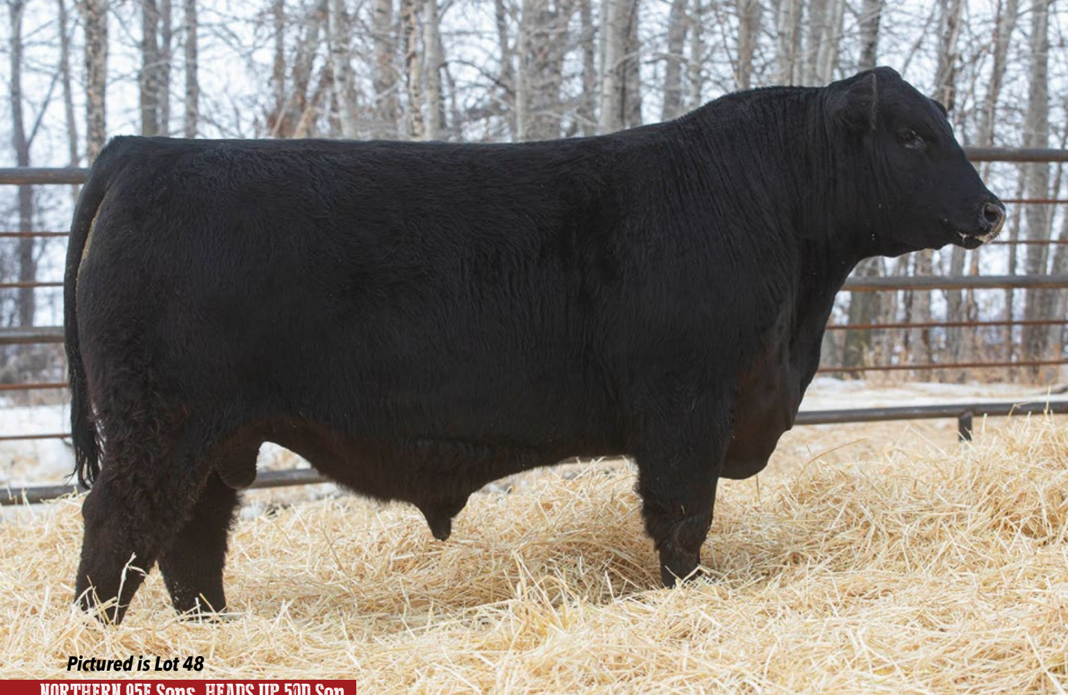
Pictured is Lot 48