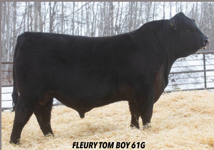
FLEURY TOM BOY 61G