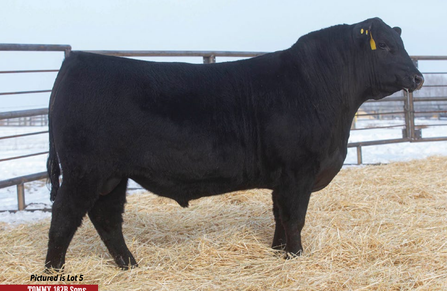
Pictured is Lot 5