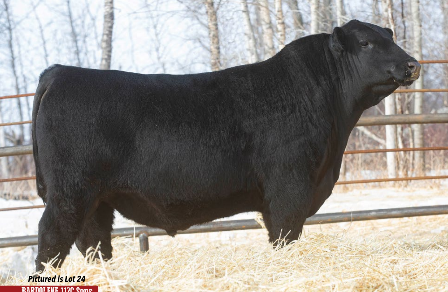
Pictured is Lot 24