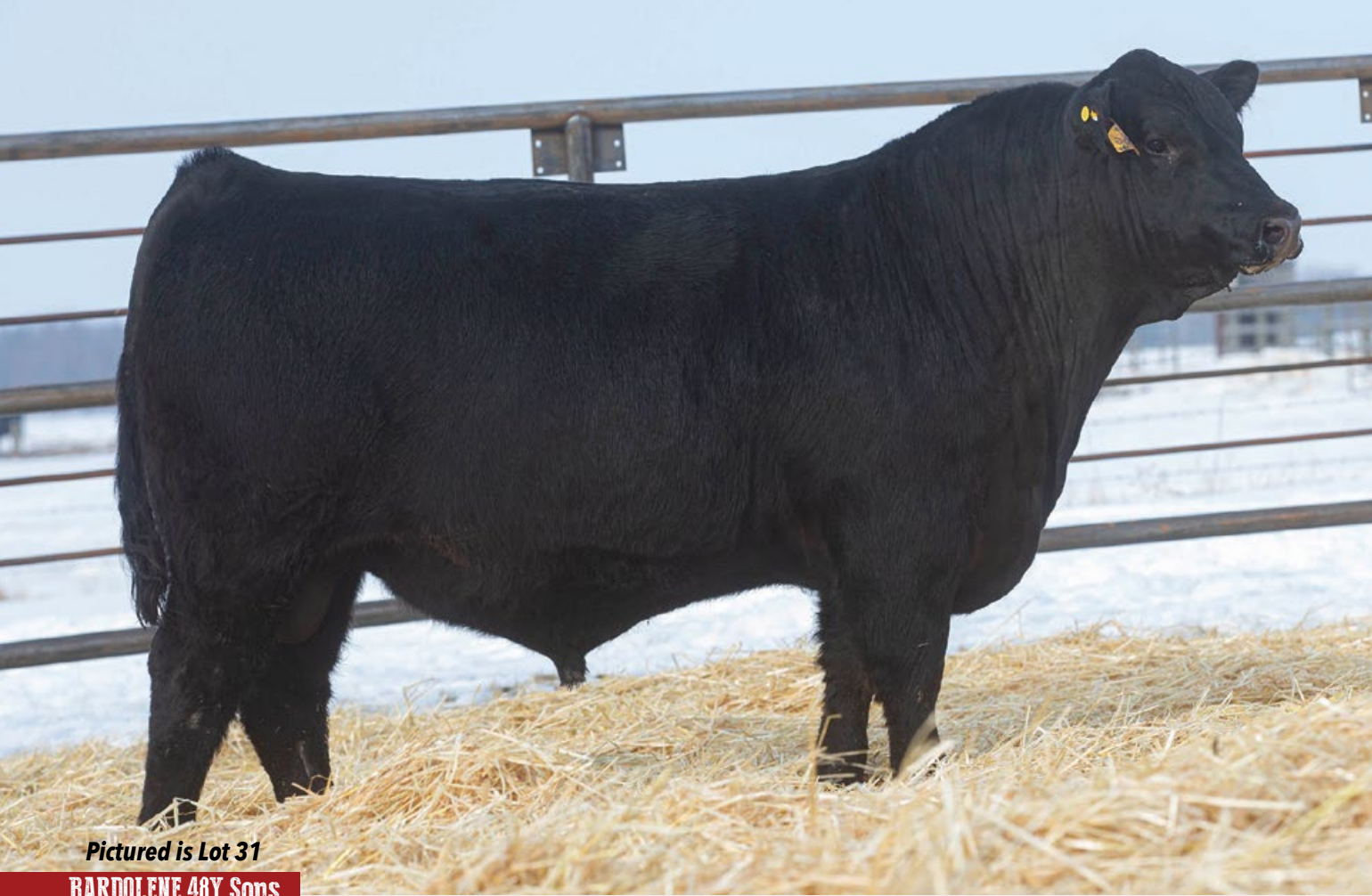
Pictured is Lot 31