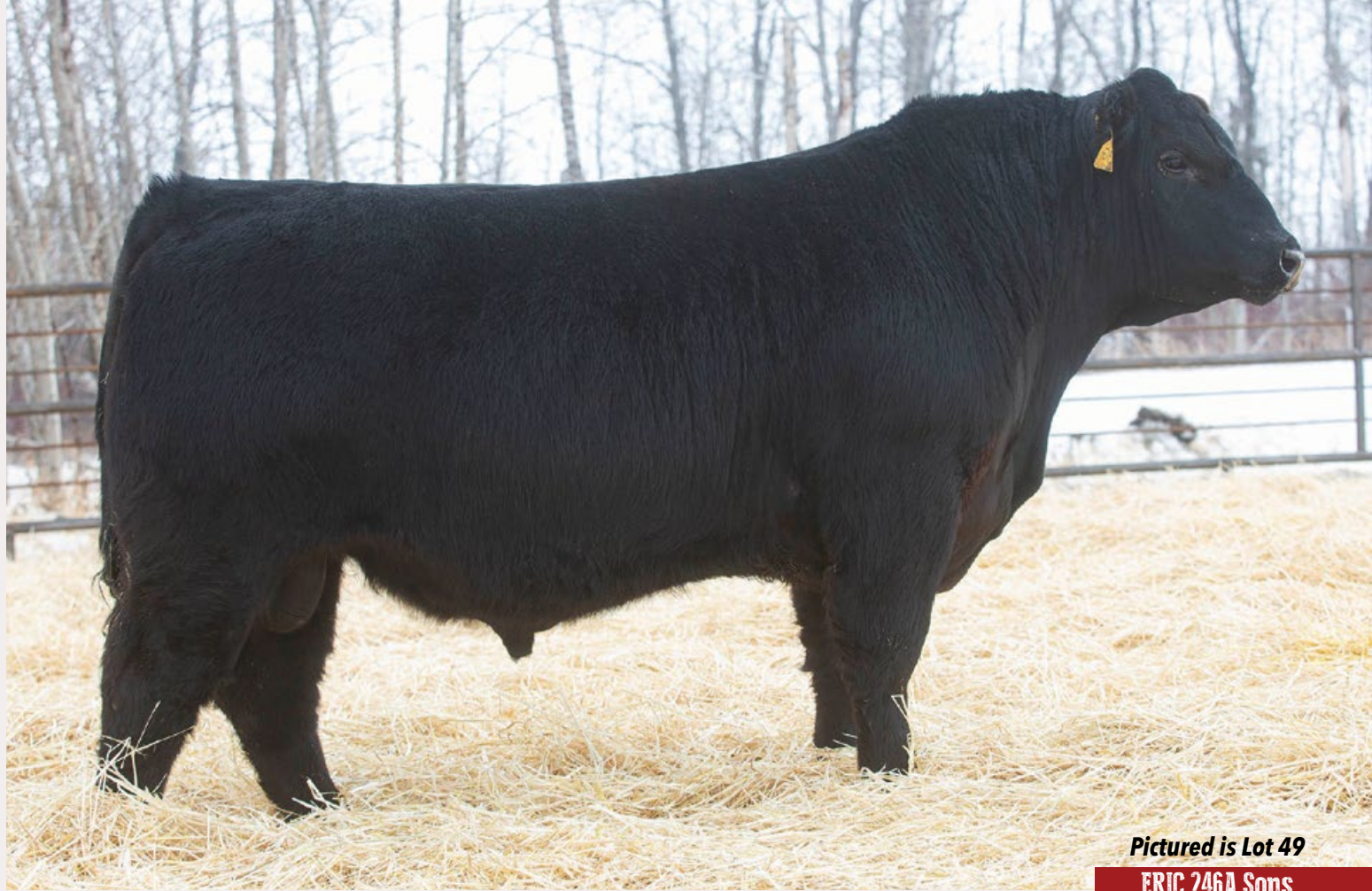
Pictured is Lot 49