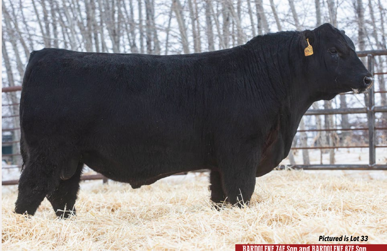
Pictured is Lot 33