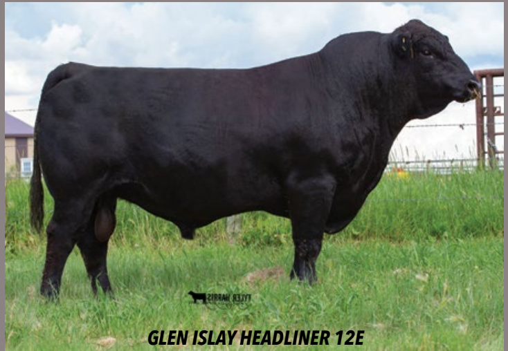
GLEN ISLAY HEADLINER 12E