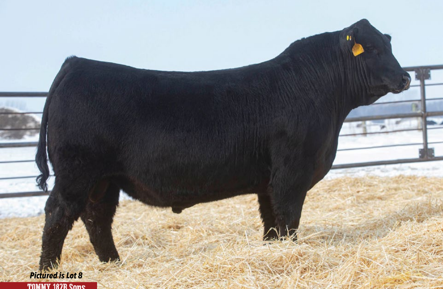
Pictured is Lot 8