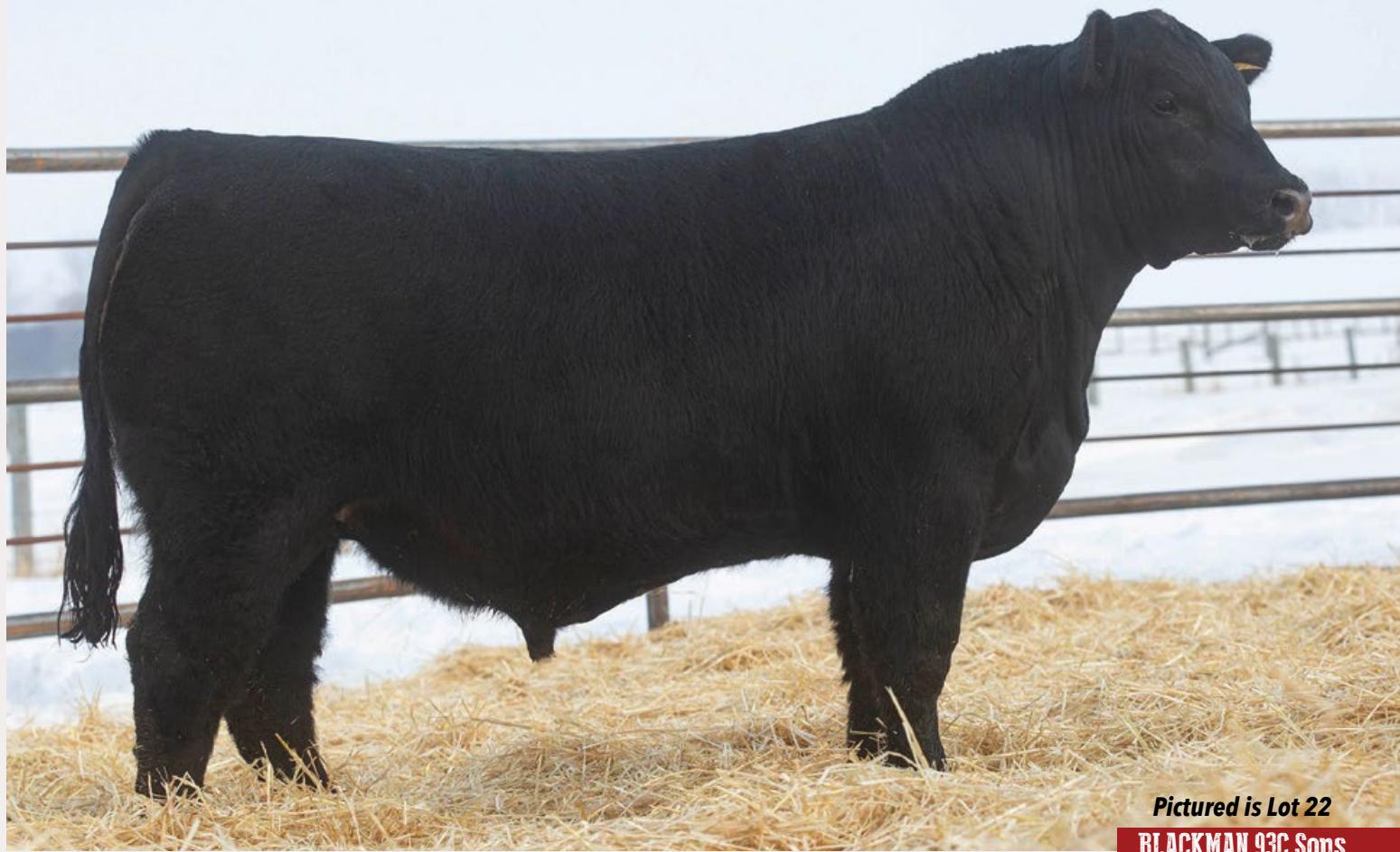
Pictured is Lot 22 BLACKMAN 93C Sons