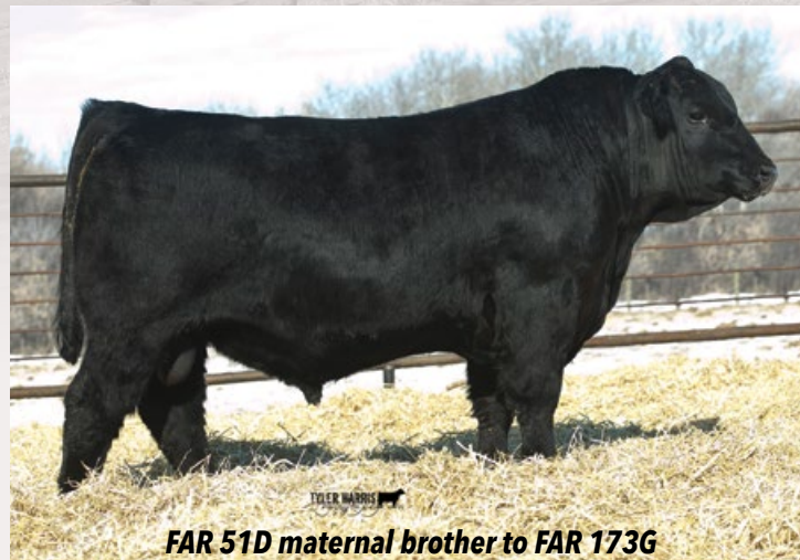
FAR 51D maternal brother to FAR 173G