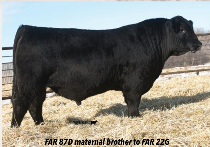
FAR 87D maternal brother to FAR 22G