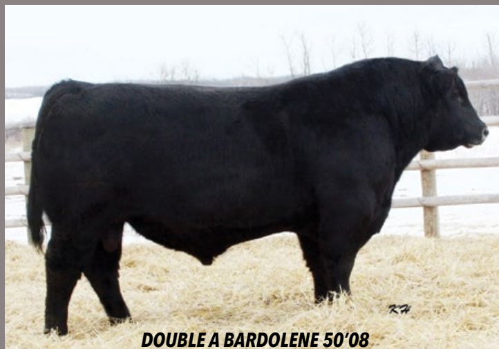
DOUBLE A BARDOLENE 50'08