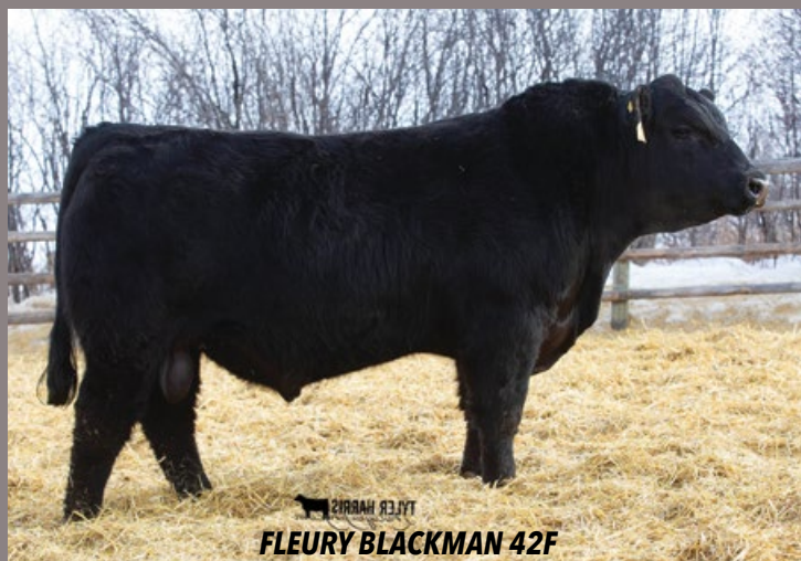
FLEURY BLACKMAN 42F