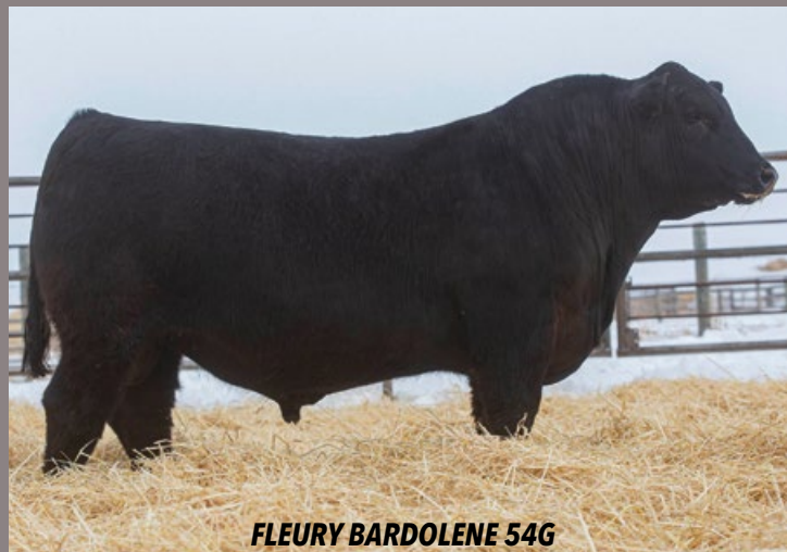
FLEURY BARDOLENE 54G