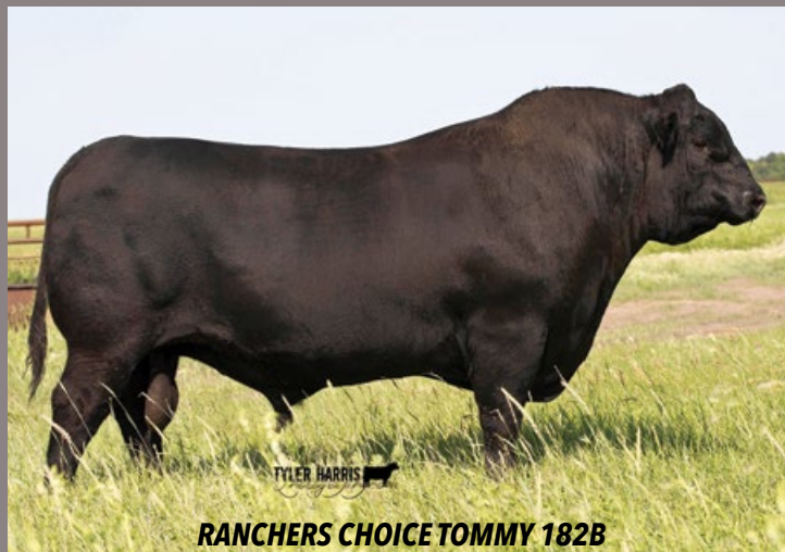
RANCHERS CHOICE TOMMY 182B