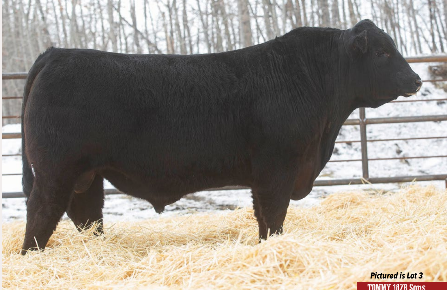
Pictured is Lot 3 TOMMY 182B Sons