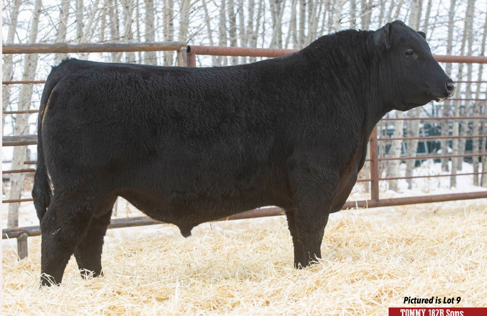
Pictured is Lot 9 TOMMY 182B Sons