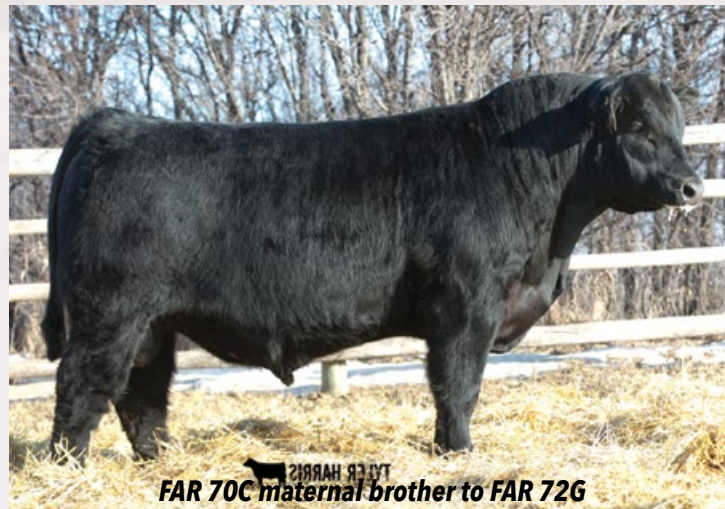
FAR 70C maternal brother to FAR 72G