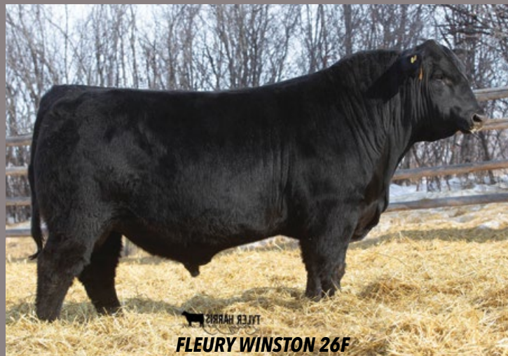
FLEURY WINSTON 26F