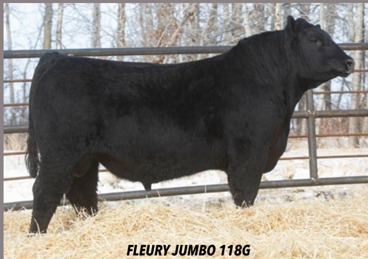
FLEURY JUMBO 118G