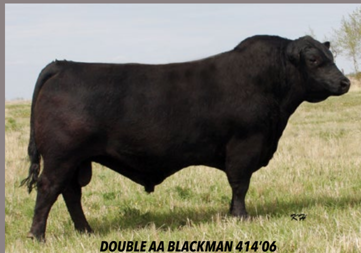
DOUBLE AA BLACKMAN 414'06