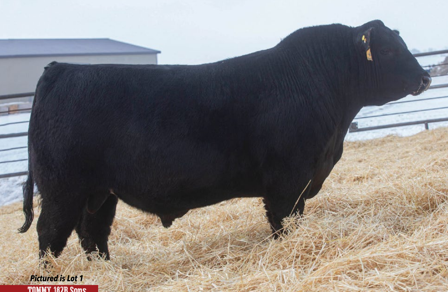
Pictured is Lot 1 TOMMY 182B Sons