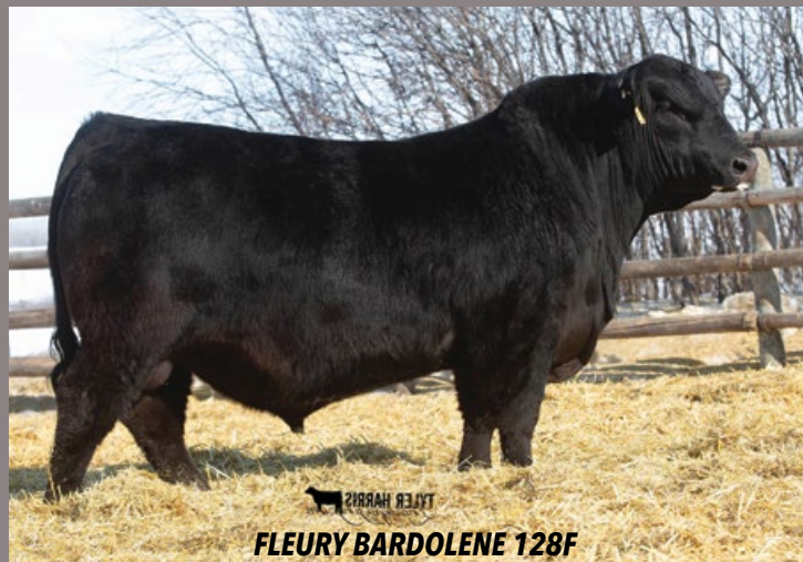
FLEURY BARDOLENE 128F