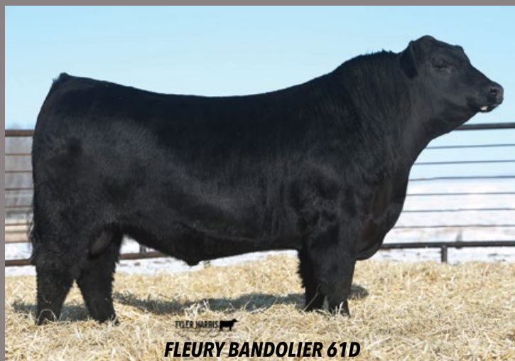
FLEURY BANDOLIER 61D