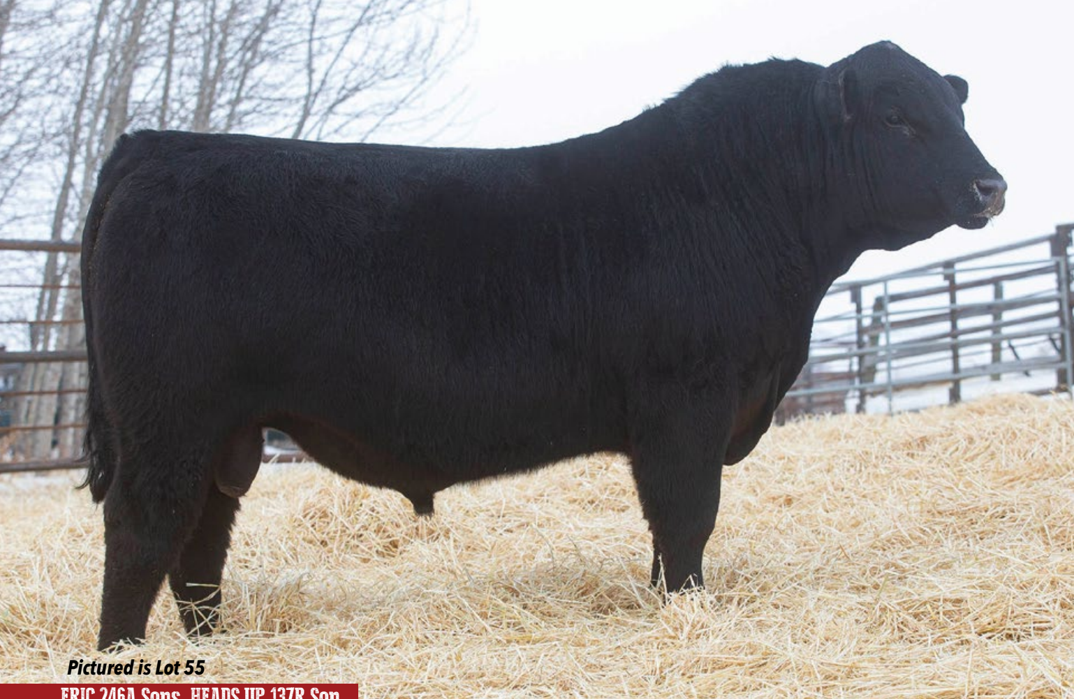
Pictured is Lot 55