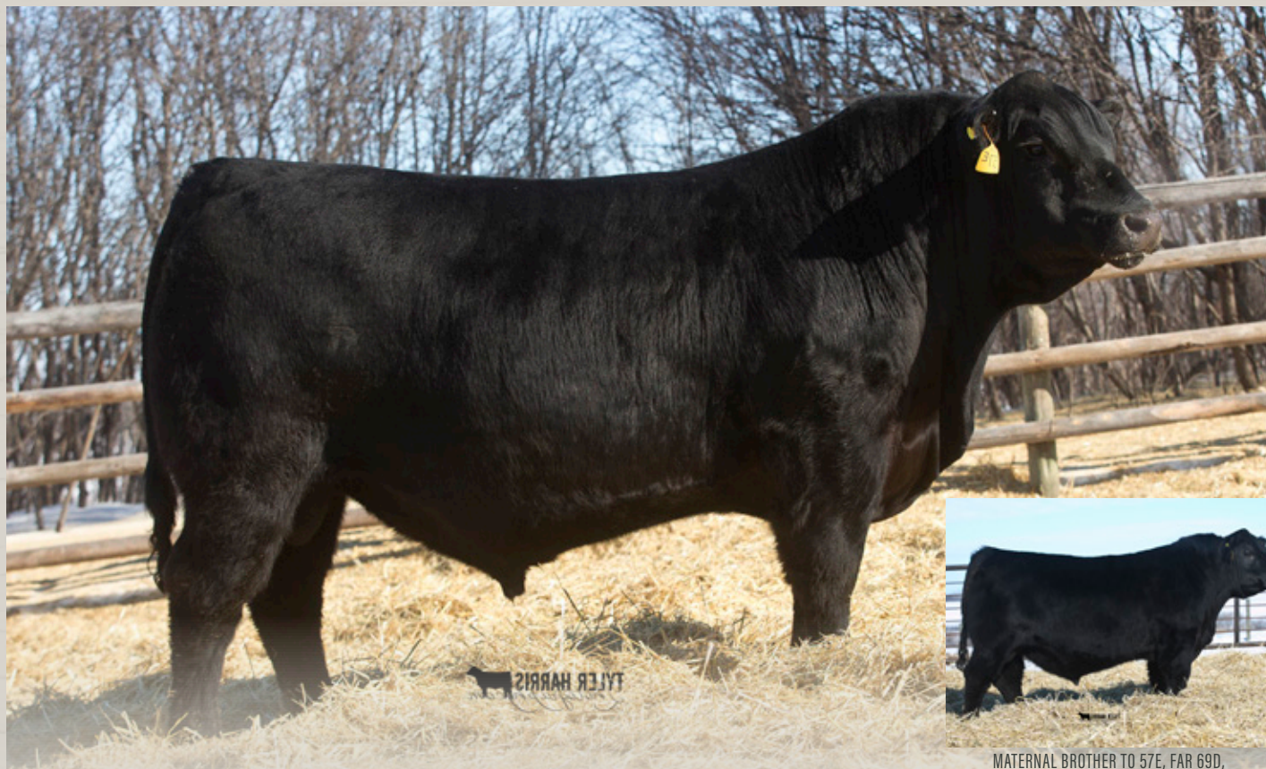
MATERNAL BROTHER TO 57E, FAR 69D, SOLD TO D.R. LAND & CATTLE