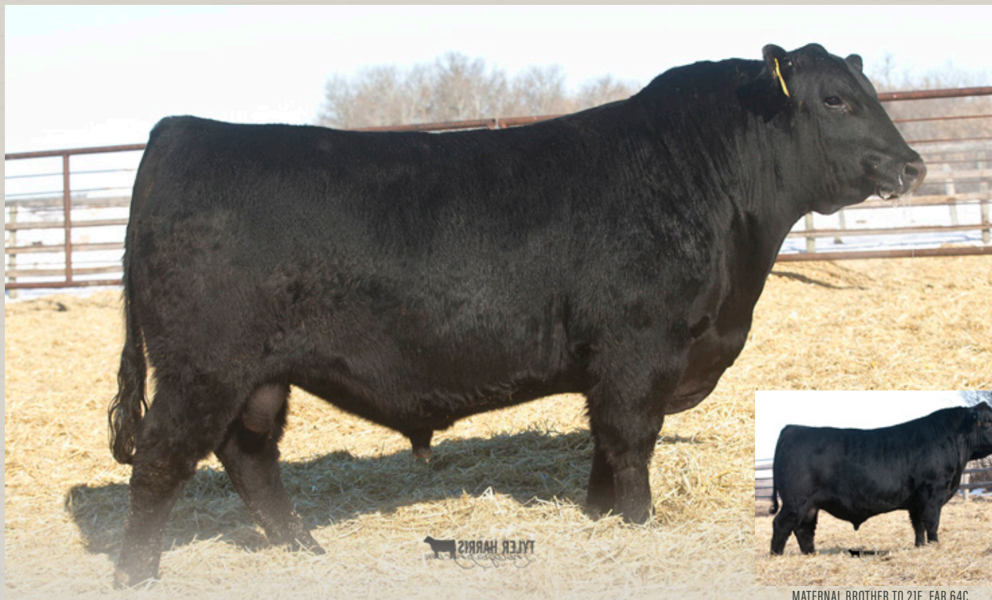
MATERNAL BROTHER TO 21E, FAR 64C, SOLD TO STONEYVIEW FARMS