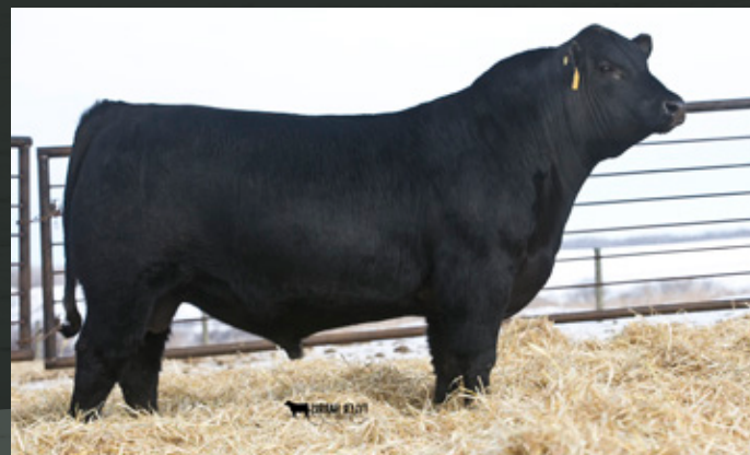
SON OF RANCHERS CHOICE BLACKMAN 141A SOLD IN OUR 2018 BULL SALE

BTR 141A * BORN FEBRUARY 26 2013 * REG #1764179