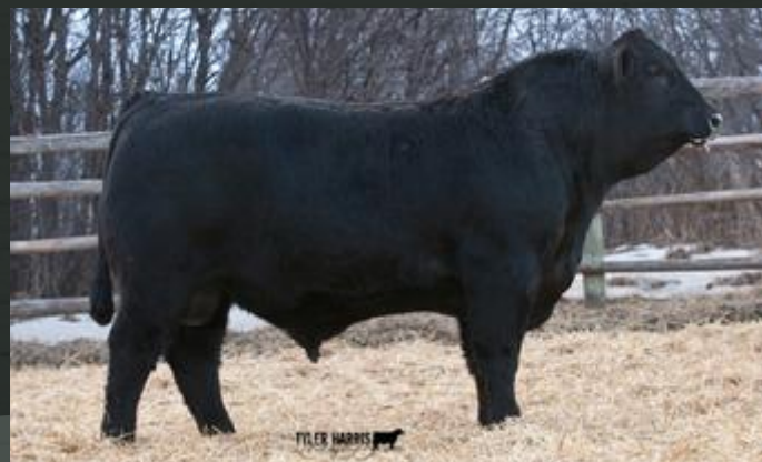
SON OF RANCHERS CHOICE BLACKMAN 141A SOLD IN OUR 2017 BULL SALE

BTR 141A * BORN FEBRUARY 26 2013 * REG #1764179