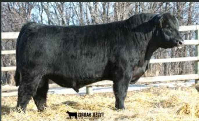
2017 HIGH SELLING BULL, SON OF SEALIN CREEK NORTHERN 15A SOLD TO DAVIES LIVESTOCK

PAK 15A * BORN 27/01/2013 * REG #1722477