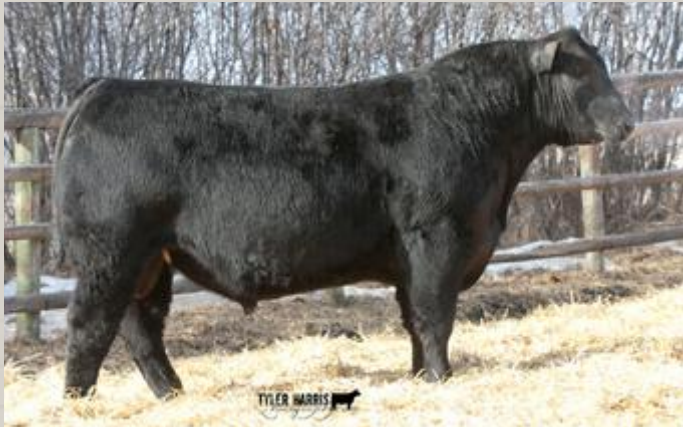
MATERNAL BROTHER TO 47D, FAR 13C, SOLD TO ROD BLENKIRON