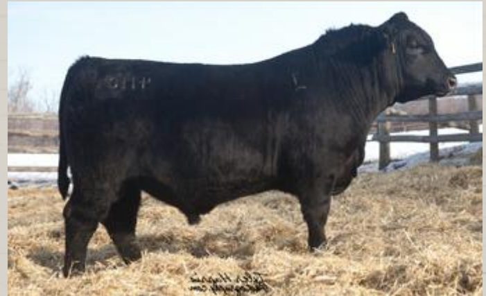
MATERNAL BROTHER TO 50D, FAR 110B, SOLD TO MATADOR PASTURE COOP LTD.