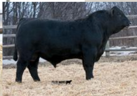
MATERNAL BROTHER TO RCE 148D, RCE 180C, SOLD TO BELMORAL ANGUS