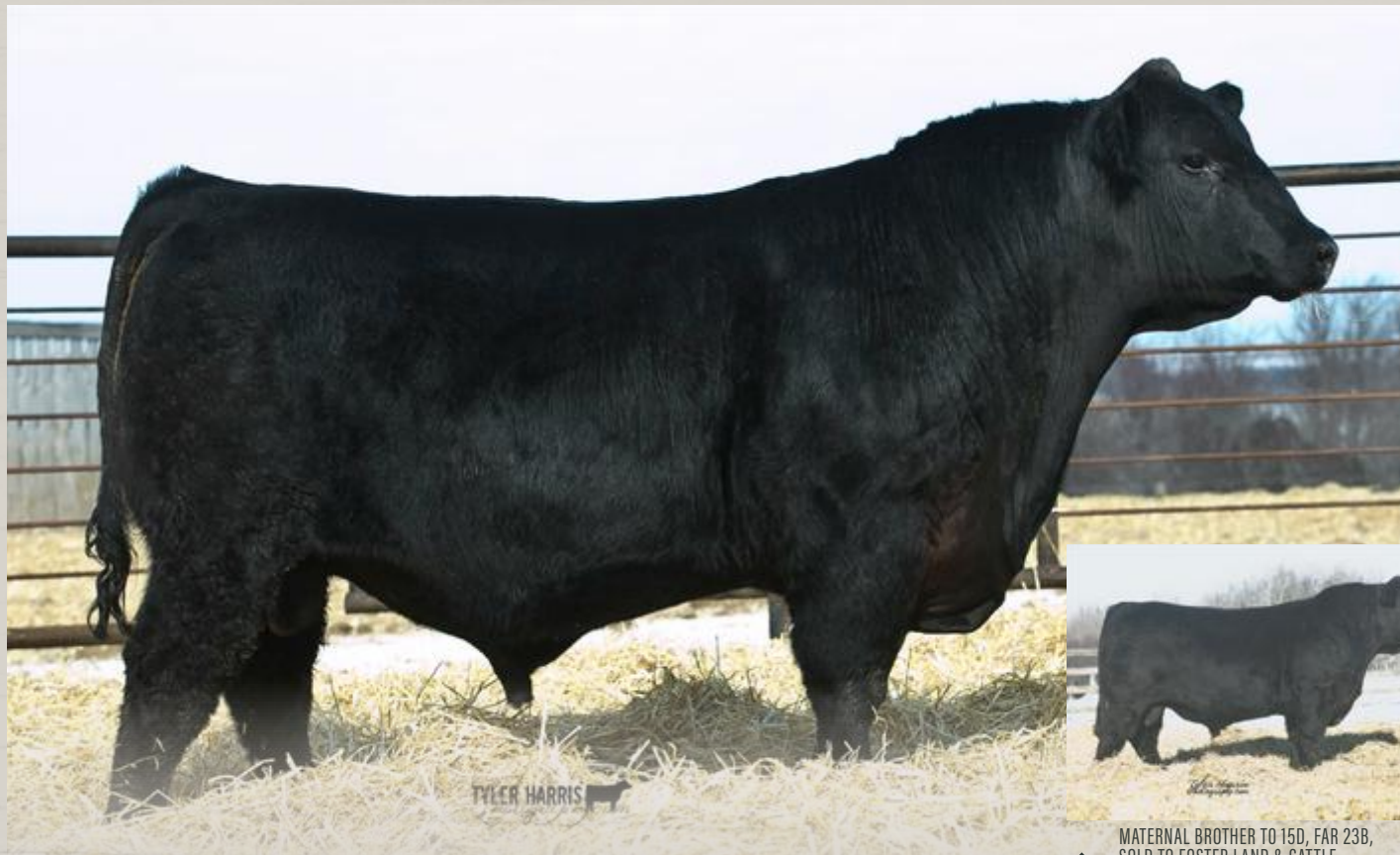
MATERNAL BROTHER TO 15D, FAR 23B, SOLD TO FOSTER LAND & CATTLE