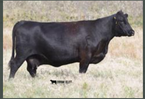
FLEURY BLACKCLASS 74Y, DAM OF LOT 28